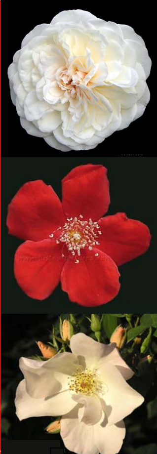
Some fine climbing roses for our area. Top to bottom: Sombreuil, Altissimo, and Sally Holmes